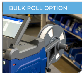
BULK ROLL OPTION